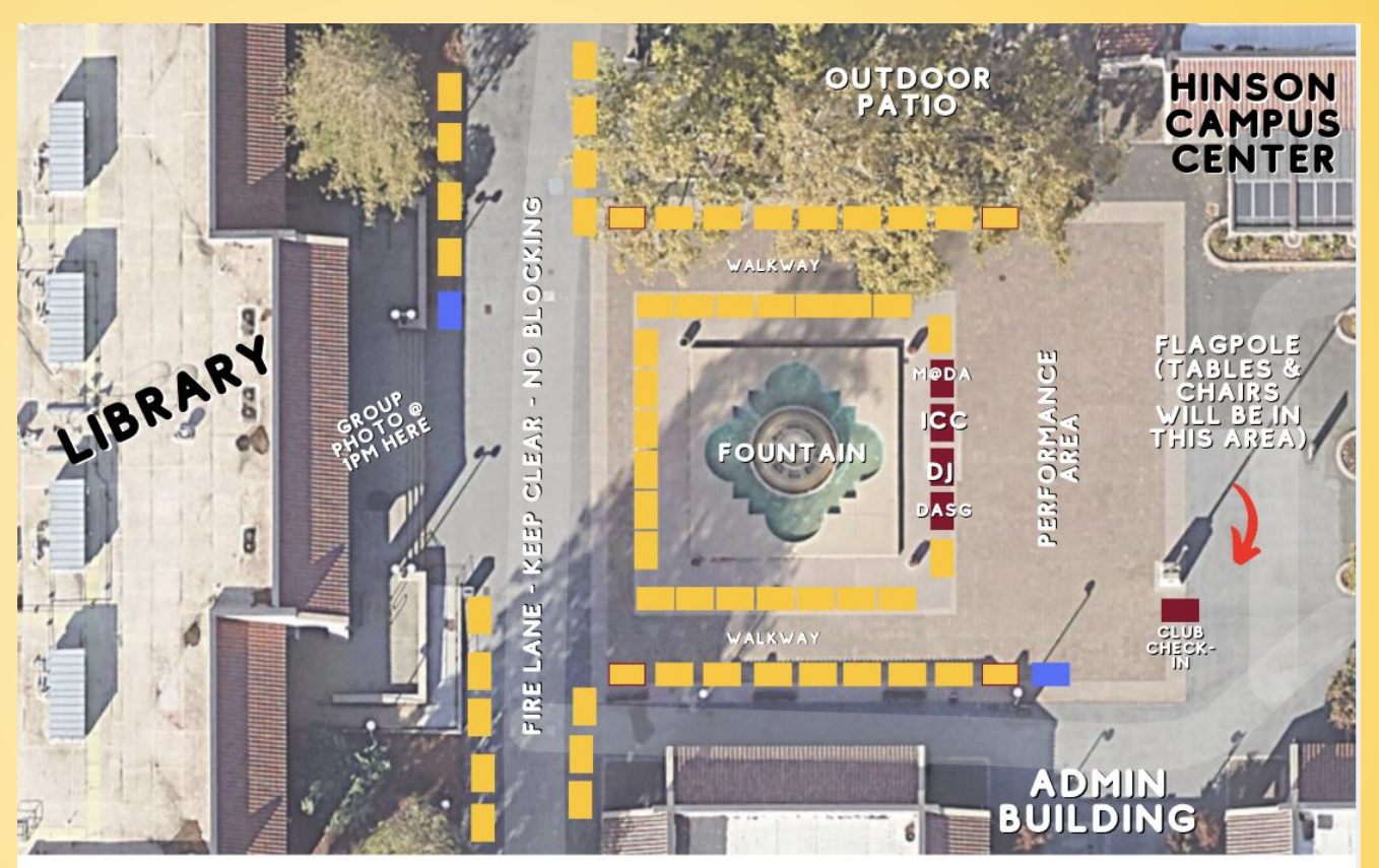
DIAGRAM NOT EXACTLY TO SCALE, ONLY FOR LAYOUT PURPOSES