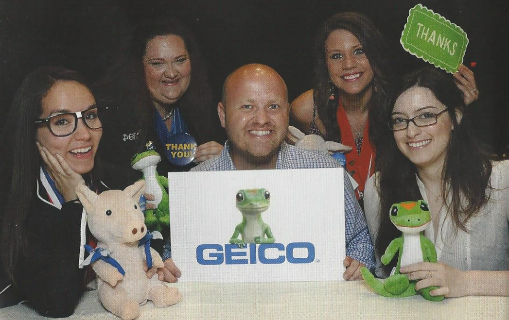
GEICO Scholarship Recipients 2015 International Convention

Detailed information on scholarships provided by Phi Theta Kappa and additional scholarship opportunities for community college students may be found at ptk.org/scholarships .