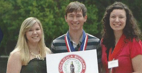
Leaders of Promise Scholarship Recipients 2015 International Convention